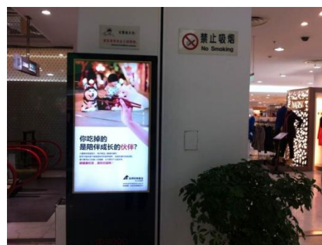
LED advertisement in Beijing Zhuangsheng SOGO