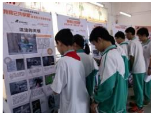
Left: Exhibition in Sichuan University of Media and Communications