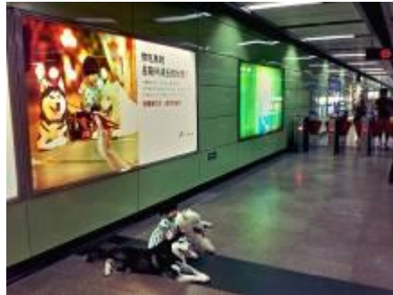
Right: Live version of our ad “Companion”