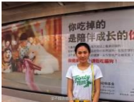
Left: Weibo user taking part in the activity of “Be Healthy snap shot”

Meanwhile, the online activity in Weibo of “Be Healthy snap shot” is also in progress. Weibo users can participate by finding the “Be healthy. Say NO to cat and dog meat” ads or posters in their cities, and then taking a photo with the ads and posters to upload to the topic of #Be healthy. Say NO to cat and dog meat# on the Weibo. We will hold a lucky draw every month to give out souvenirs to 30 lucky supporters. This activity received a large scale of responses nationwide. One photo that received the most forwards and likes was the little girl “Xiaobao”, and the dogs “BuBu” and “DouDou” from one of our ads named “Companion” who, together, took a photo in front of that poster. (Please refer to the link: http://weibo.com/1868995340/A6XE0ec4Q ). This activity will last until the end of the year.