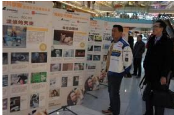
Left: First exhibition in Shanghai co-hosted by Shanghai University Students Environmental Protection Association