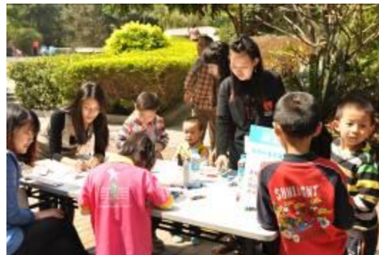
Right: Popular public education games

We aim to raise the awareness of responsible dog care and mutual understanding through these interactions with the residents so that big cities such as Shenzhen can be places for people and animals to live harmoniously.