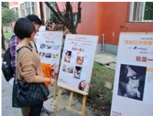
Right: Exhibition in Dalian Roosevelt International Centre