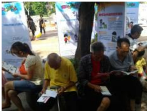
Left: Residents reading promotional materials of responsible dog care

The activities received positive feedback from the residents. Consequently, they had an understanding of responsible dog care and the procedure for dog registration through consultation and our promotion materials.